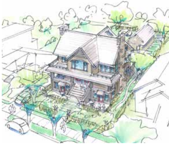
Figure 42: Illustrative example of a heritage conversion (heritage home converted to multiple strata or rental suites).