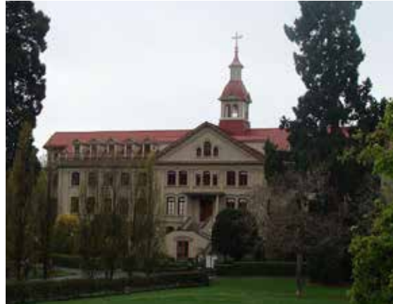
St Ann's Academy