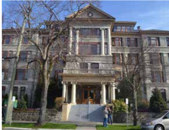
St Joseph Apartments (Heritage designated)

As Fairfield transitions into the future, maintaining and integrating heritage is integral to sustaining character and sense of place.