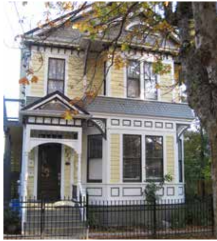
Fig 43: Example of heritage conversion with four units