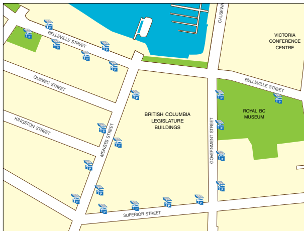
JAMES BAY TEST AREA

During the test period in April, a demonstration pay station will be visiting venues and events in the Capital Region to provide opportunities for the public to try out the new system.