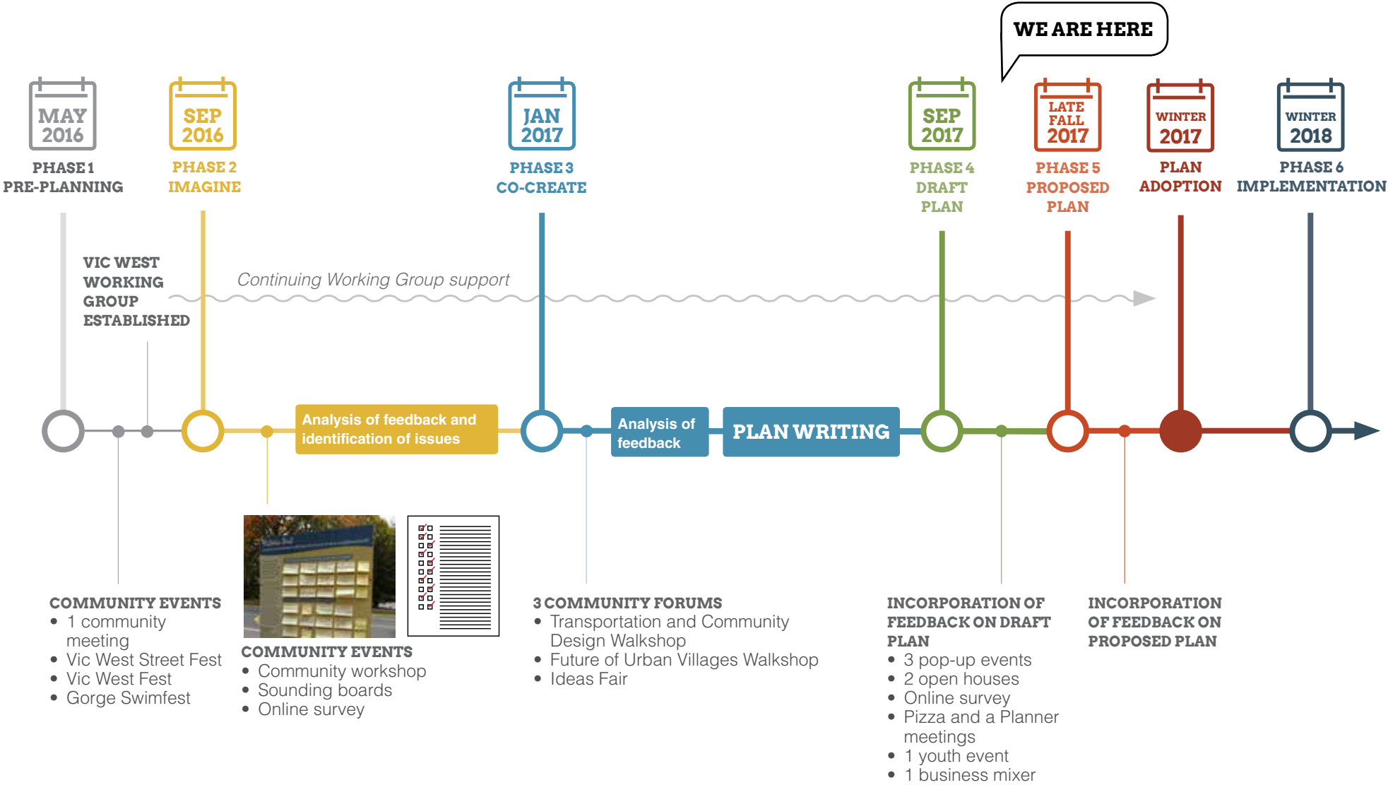
Figure 2. Plan Process