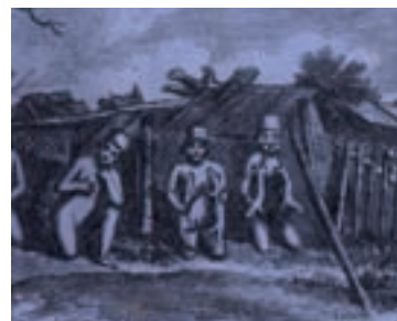
INDIAN BURIAL GROUND NEAR VICTORIA

Project partners include: the Esquimalt and Songhees Nations, the City of Victoria, Government of Canada, Department of Canadian Heritage, Cultural Capitals of Canada Program, the Province of British Columbia, the Provincial Capital Commission, the Greater Victoria Harbour Authority, and the Union of British Columbia Municipalities.