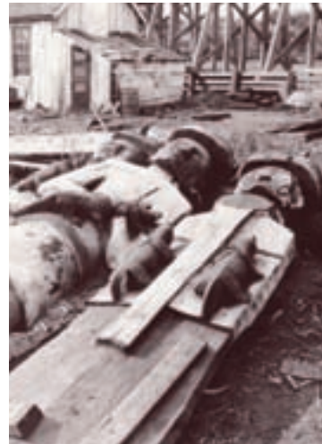
CARVED HOUSE POSTS ON THE OLD SONGHEES RESERVE