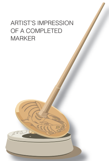
ARTIST'S IMPRESSION OF A COMPLETED MARKER