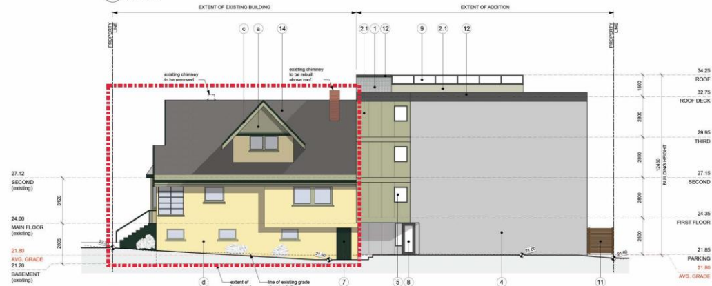
4 WEST ELEVATION Scale: 1:100