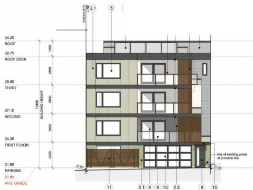
1 MEARES STREET (REAR) SOUTH ELEVATION Scale: 1:100