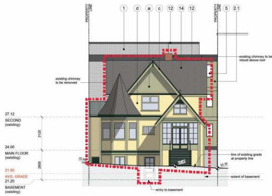
3 FORT STREET (FRONT) NORTH ELEVATION Scale: 1:100