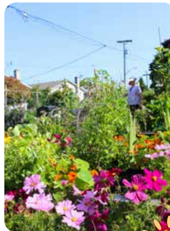
Montreal Street Community Garden