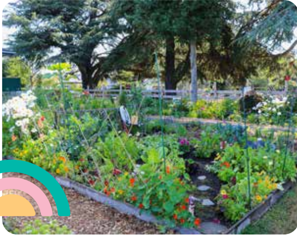
Montreal Street Community Garden in James Bay