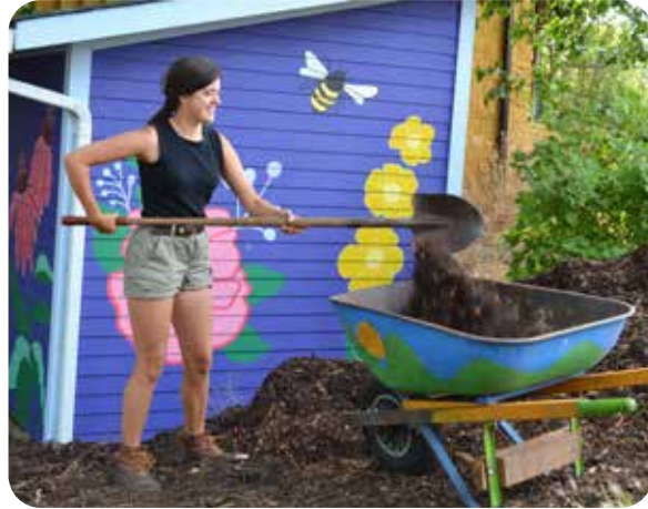
William Stevenson Community Orchard and Kitchen Garden in Fernwood