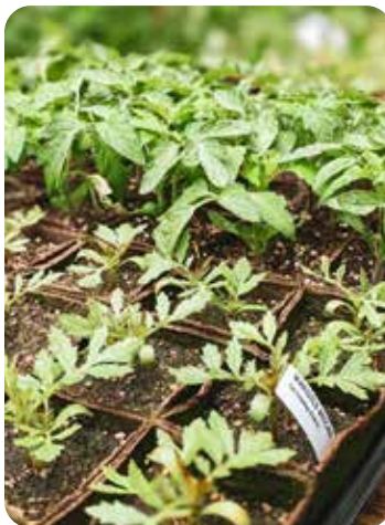
Free vegetable plants through Get Growing, Victoria!