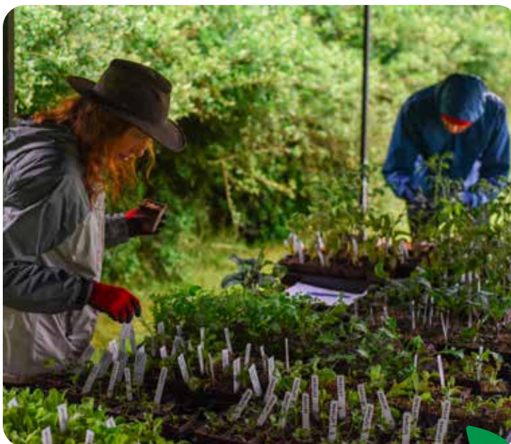
The Rockland neighbourhood distribution day for Get Growing, Victoria! hosted by Government House