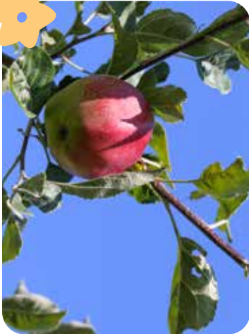
Banfield Community Orchard in Victoria West