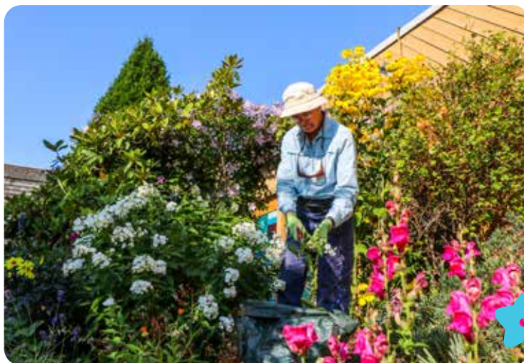
James Bay New Horizons Pollinator Garden