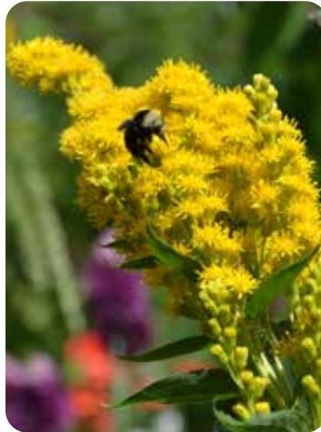
Pollinators in Fernwood's Earthbound Garden