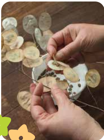
Seed saving by James Bay Little Free Seed Library volunteers