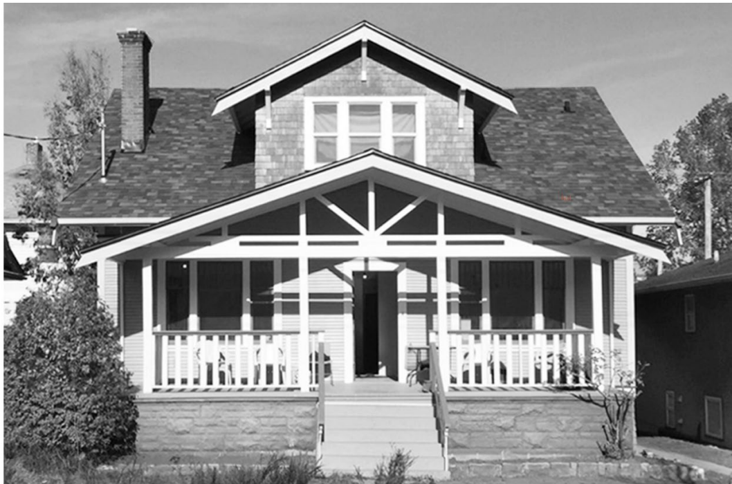
01 SOUTH ELEVATION PHOTO - EXISTING