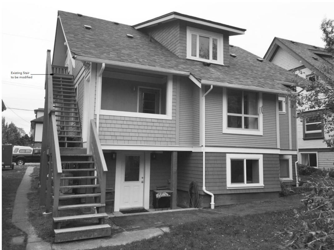
02 NORTH ELEVATION PHOTO- EXISTING